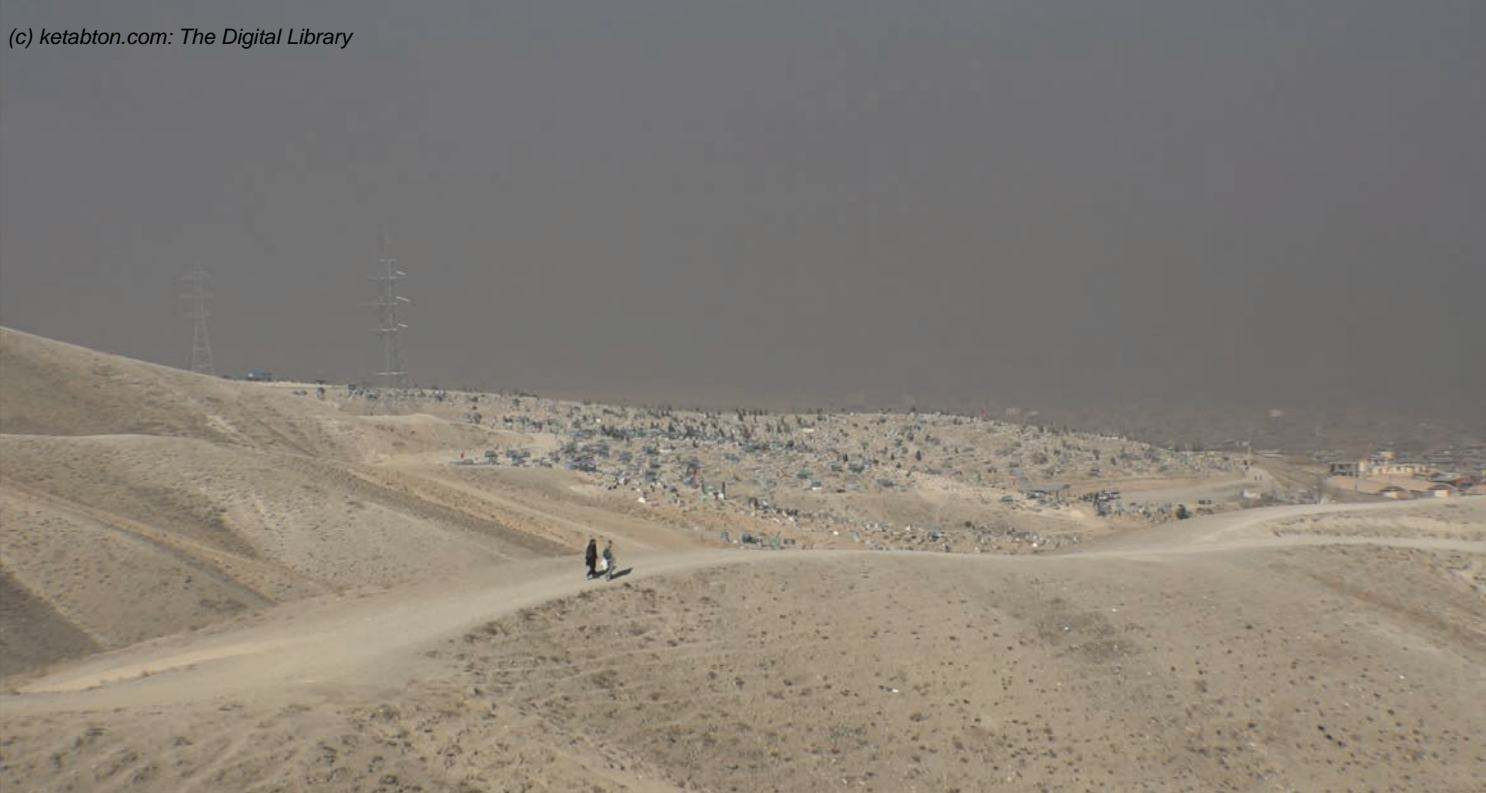
Haji Nabi Hills, Southwest Kabul, Afghanistan.

southern Afghan heartlands. This type of charisma was based not on eloquence or fiery soundbites, but rather by cultivating the perception of an otherworldly, selfless, guileless persona that seemed to many Talibs the antidote to the corrupted materialism around them. The contrast to the worldly Osama bin Laden could not be greater. In this sense, the story of Mullah Omar shows us just how different the Taliban and al-Qaeda really are. Today, as the prospect of peace hinges, in part, on trusting whether the Taliban can indeed split with al-Qaeda, understanding Mullah Omar's story is more crucial than ever.