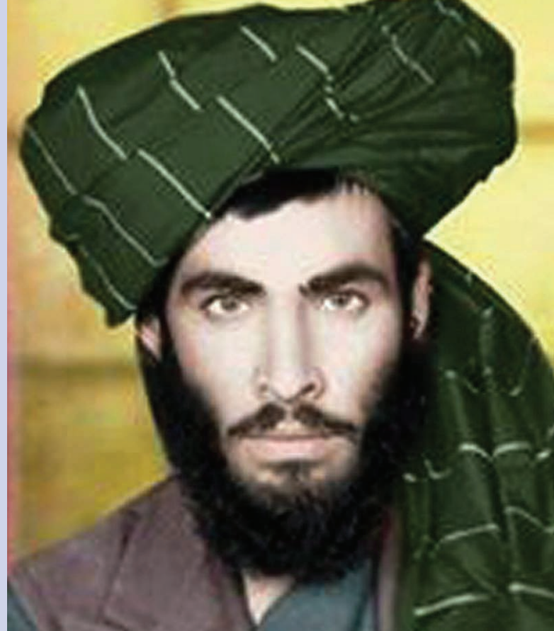
Clockwise from right: Mullah Omar in 1978, 1992 and 1996.