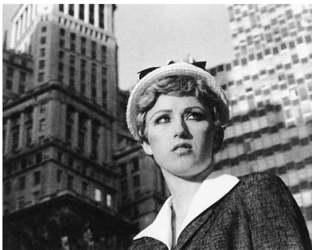
3, 4. Untitled film still (1977) by Cindy Sherman. Cindy Sherman as Hitchcock or as Antonioni might have seen her; but didn't.