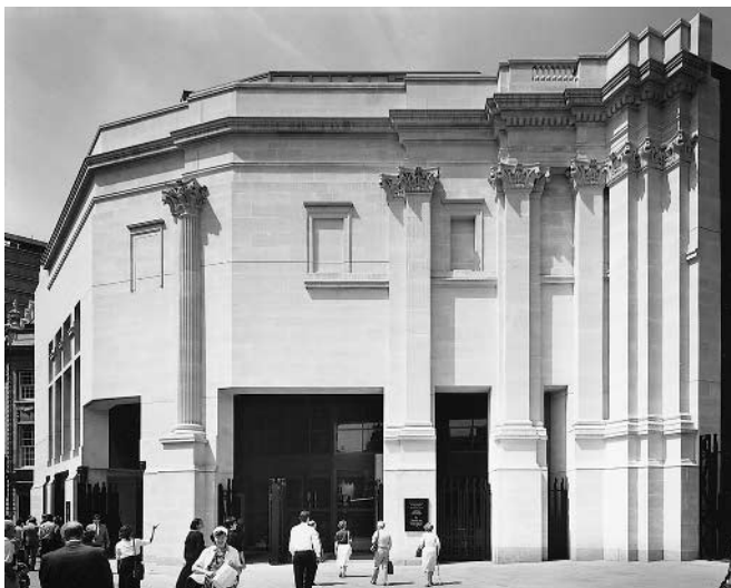
12. Sainsbury Wing, National Gallery, London (1991) by Venturi, Scott Brown and Associates.

A new building, but a pastiche of earlier styles. Is this ironic?