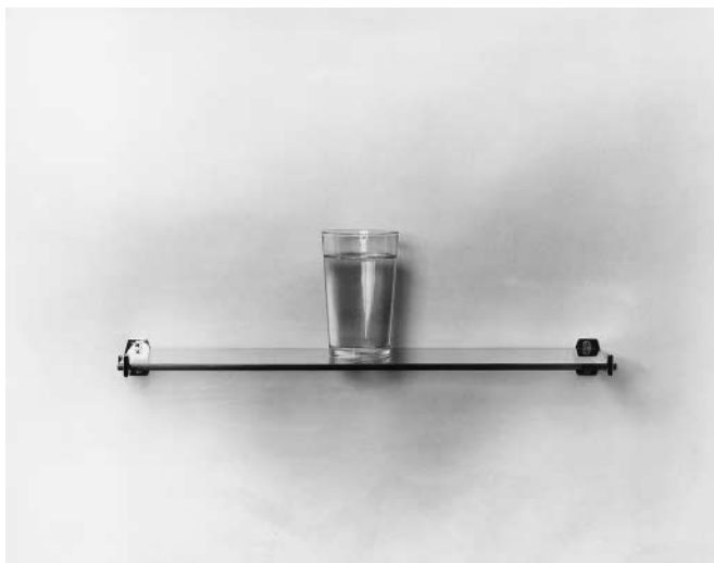
The culture of postmodernism

10. An Oak Tree (1973) by Michael Craig-Martin. Sometimes a cigar is just a cigar (Sigmund Freud, attrib.).