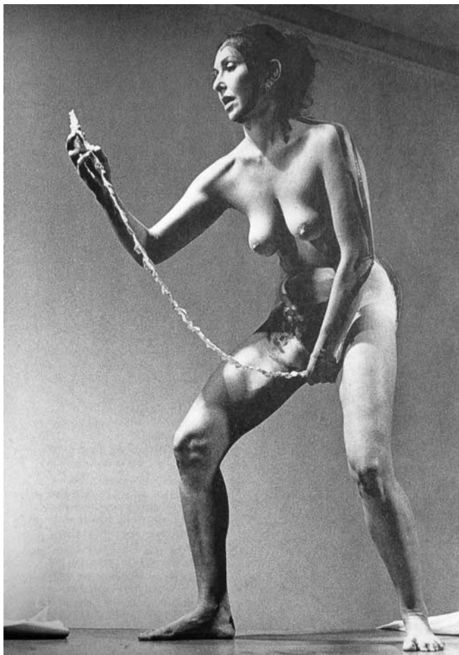
15. Interior Scroll (1975) by Carolee Schneeman.

We write with the body, but with what sense can women's writing also come from the body?