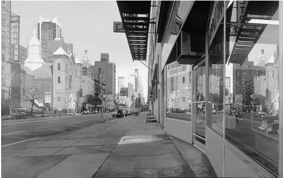
8. Holland Hotel by Richard Estes. A dangerous formal beauty, retrogressively modernist?