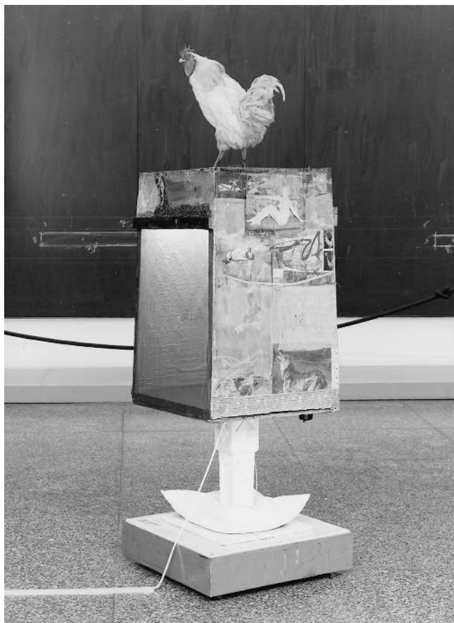
21. Odalisk (1955–8) by Robert Rauschenberg. 'Image leads to relativism leads to doubt.' Then what is the bird doing on top of it all?