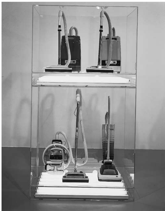
6. New Hoover Quadraflex (1981-6) by Jeff Koons. The fine art of museum display is applied to ordinary consumerist objects.