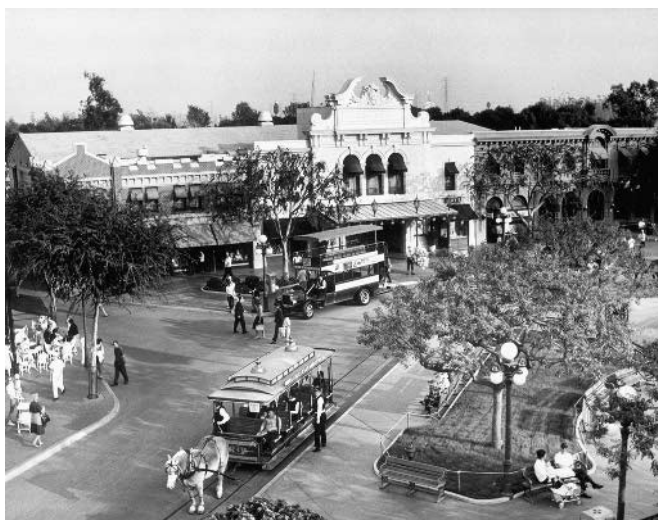
20. The Imagineers Main Street USA (1955) Anaheim, California. Is this the street where you live?

conceal the fact that it is the social; in its entirety, in its banal omnipresence, which is carceral).