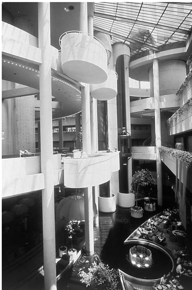
1. Interior of Westin Bonaventure Hotel by Portman. 'Postmodernist hyperspace'.