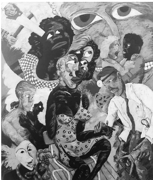
19. Grandma and the Frenchman (Identity Crisis) (1990) by Robert Colescott.

And doesn't the expression of personal identity demand an imposed narrative and a realist mode?