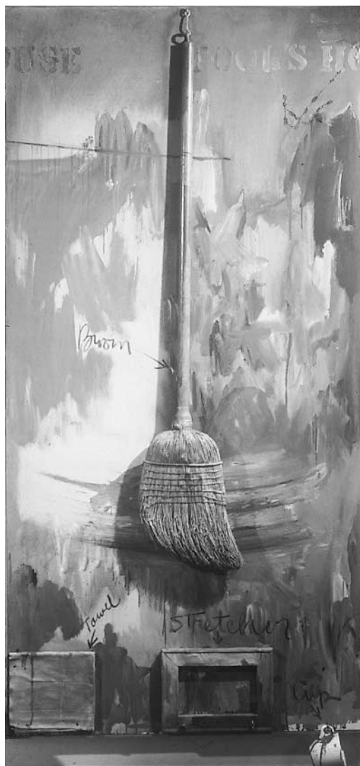
5. Fool's House (1962) by Jasper Johns.

Language, theory, the object, and art. Is this a paint brush?